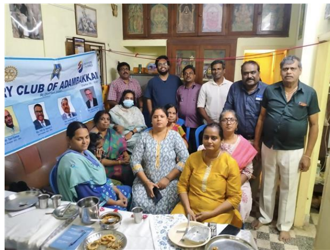
5 th Board Meeting